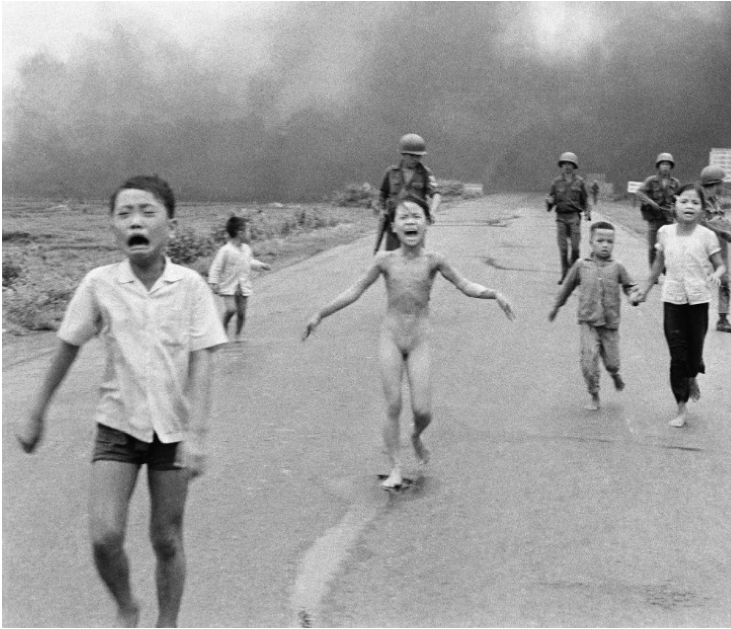
Perhapsthe most famous photo from the Vietnam War in the minds of the student generation