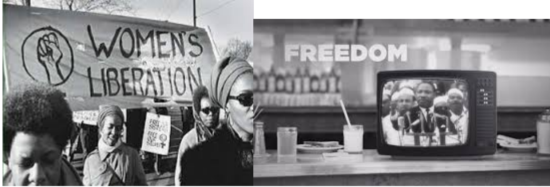
The March on Washington, August 1963 above, two former presidents, the president, and a future president and a future one at the funeral of a fifth, Herbert Hoover Above: Donald Trump with Joe McCarthy's old colleague and his lawyer as the 1960s ended as an historical period